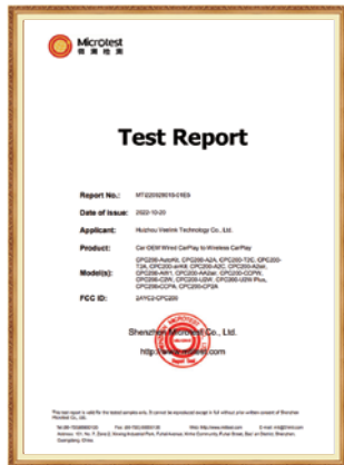
FCC Certification FCC ID:2AYC2-CPC200