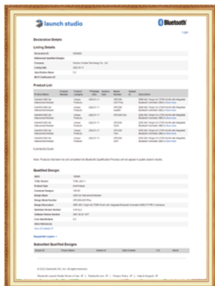
Bluetooth Certification QDID:189005