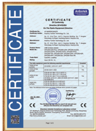
CE-RED Certification Certificate No.:AT18220WC202373