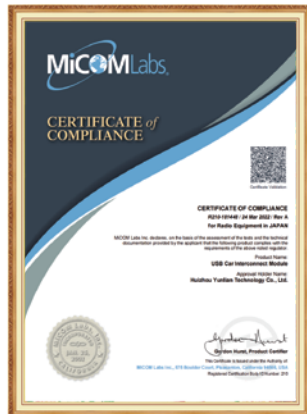
TELEC Certification Certificate ID:R210-181448