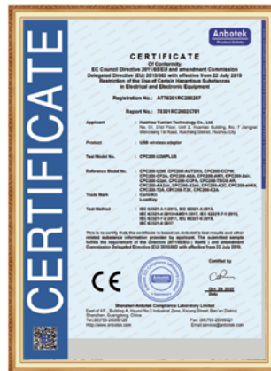
ROSH Certification Certificate No.:AT18220WC202373