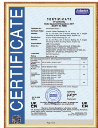
UKCA Certification Certificate No.:AT18220WC202374